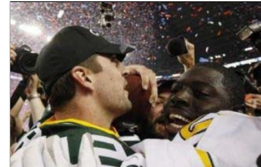
Green Bay Packers' quarterback Aaron Rodgers, left, celebrating with teammates after they defeated the Pittsburgh Steelers, 31-25 in the NFL's Super Bowl XLV football game in Arlington, Texas, on Monday.